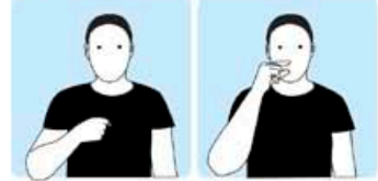
"My name is"