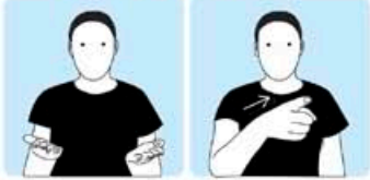
"How are you?"