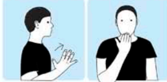
"I am Fine thank you"