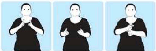
"Let's do coffee"