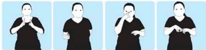
"Let's have fun"