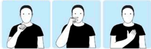
"Your name please"